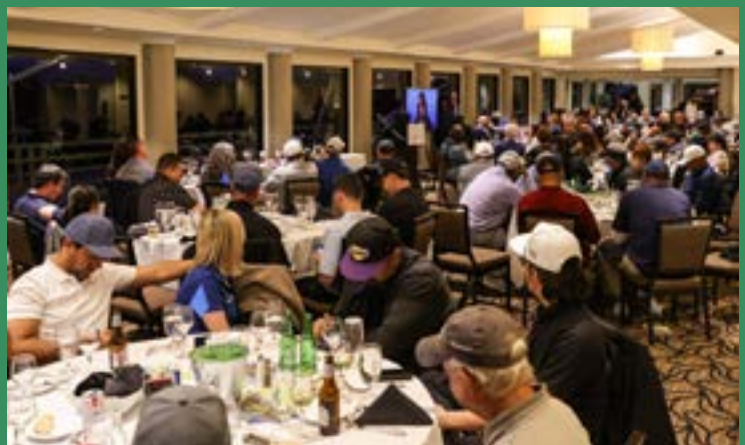
Dinner following a day of golf.